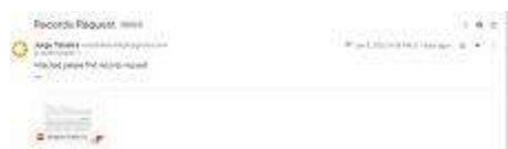
Email Abington PS.JPG 35K