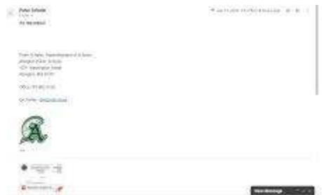
Abingtons response.JPG 56K